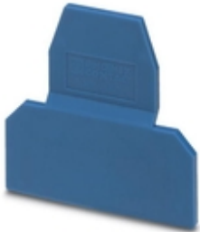
End cover, length: 56 mm, width: 2.5 mm, height: 62 mm, color: blue

Please be informed that the data shown in this PDF Document is generated from our Online Catalog. Please find the complete data in the user's documentation. Our General Terms of Use for Downloads are valid ( http://phoenixcontact.com/download )